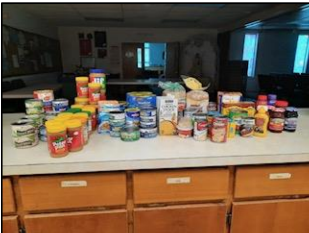
December Luncheon Meeting Collections